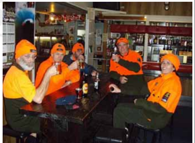
The all-important debrief!